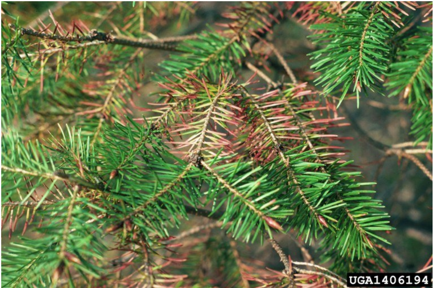
Figure 4. Previous seasons' infected needles may be cast or remain on the tree.