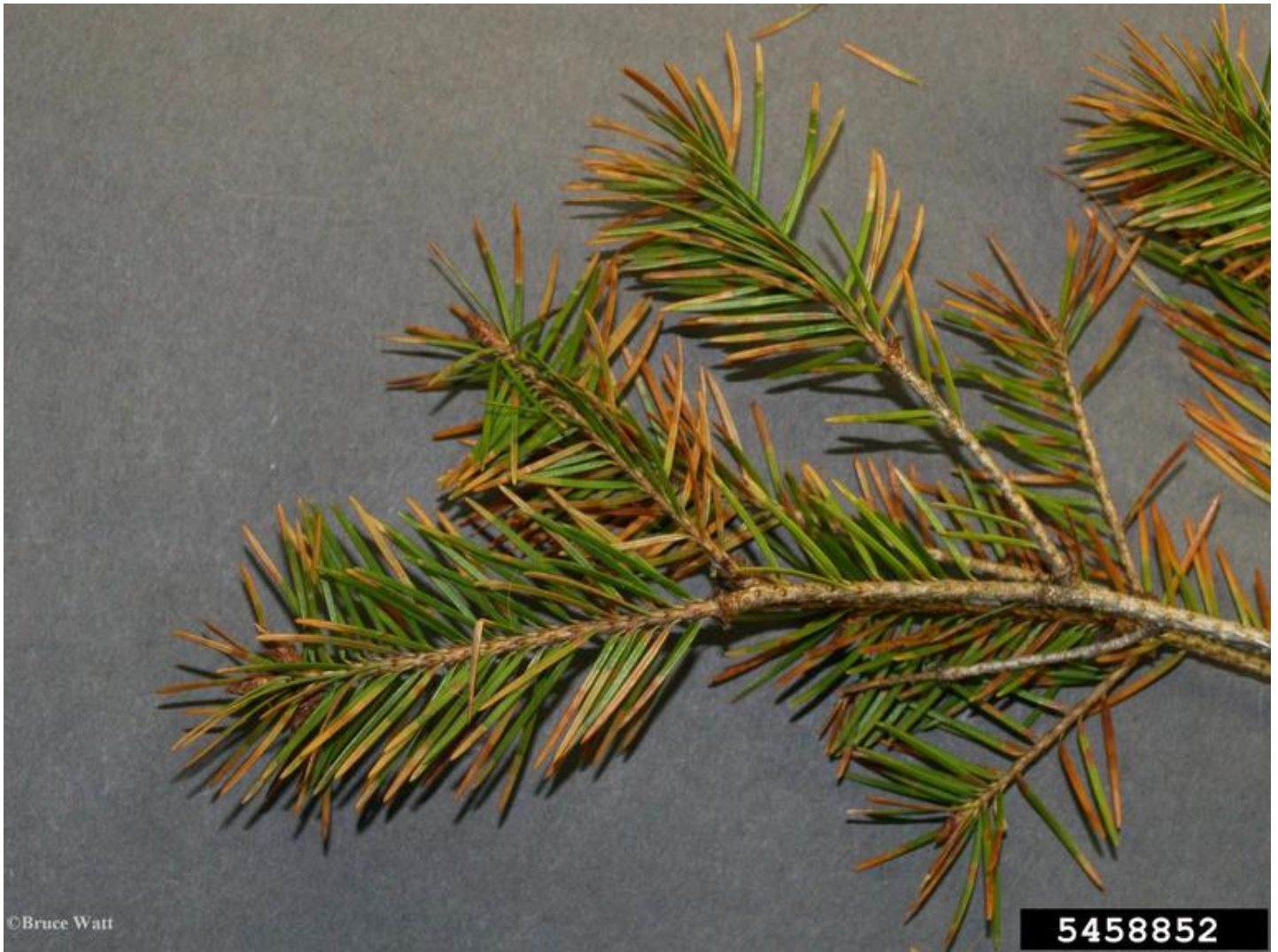
Figure 3. Infected needles brown from tip down.