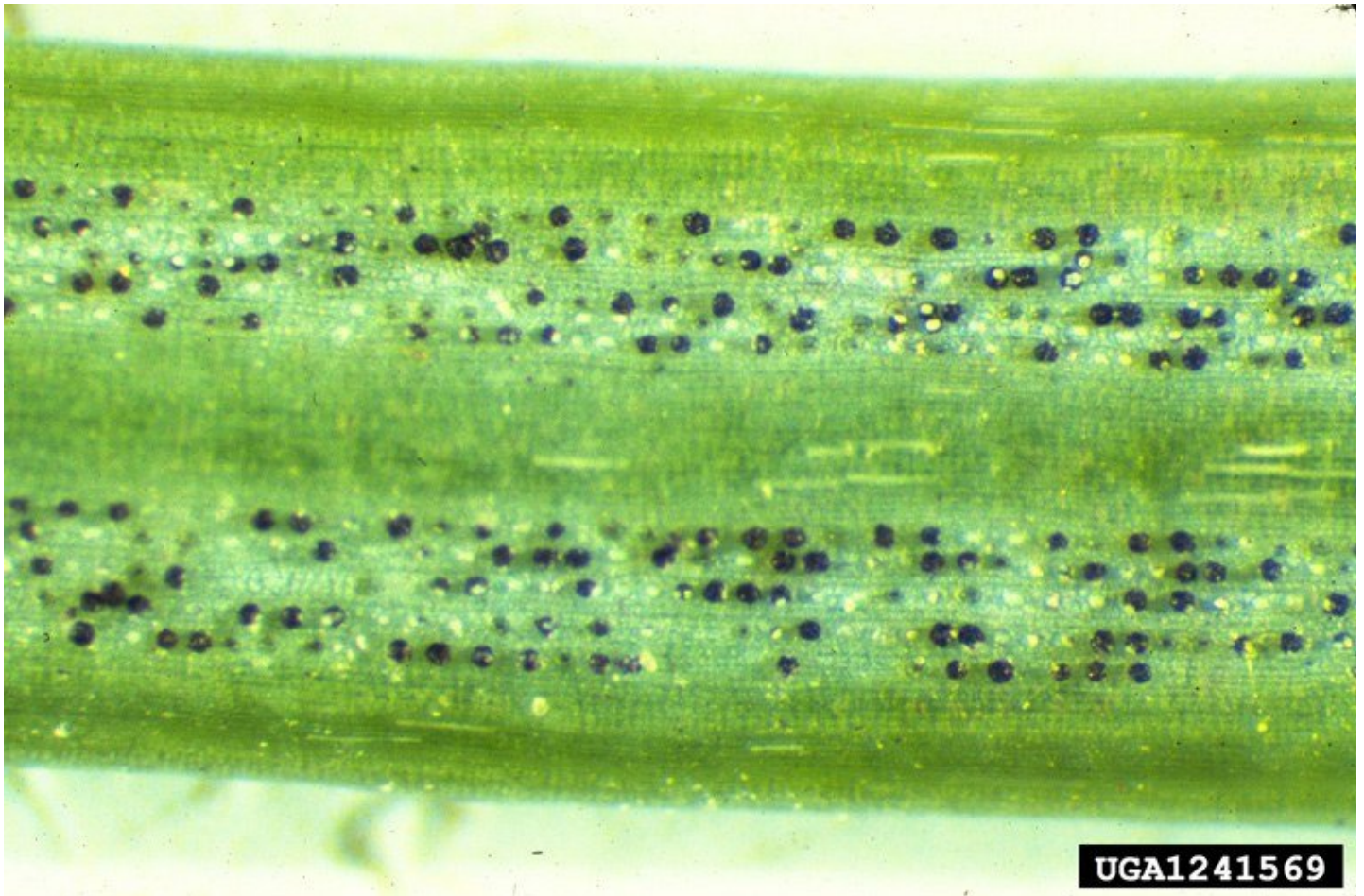
Figure 1. Black fruiting bodies on the undersides of needles pushing up through the stomates.

time (Figure 4). This significantly increases the infection potential of this disease. Symptoms are much slower to develop and may not be apparent for as long as 2 years after infection. Spore release continues for a longer time than Rhabdocline , the other common needle cast disease of Douglas-fir.